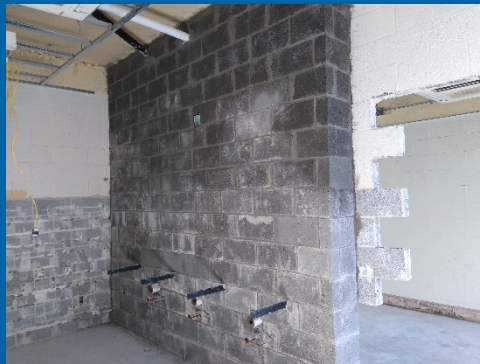
Finish masonry plumbing chases