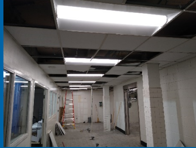
Install New Lighting in Kitchen