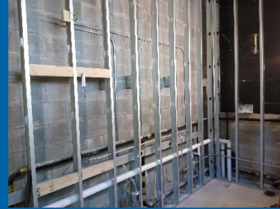
Continue Framing and Electrical Rough-in at STEM Lab